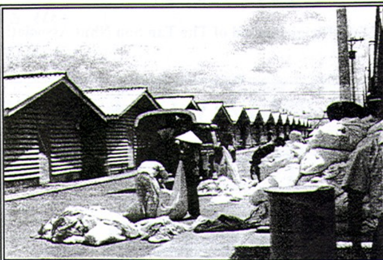
Wash Day, Tan Son Nhut Style, Circa 1968

Surely here is one of the great needs of our time; a concept of God that is big