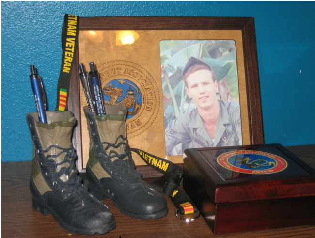
↑ The Boot

The TSNA BX has a couple of new items that are in limited supply. The "Boot" and the "TSNA Box" are leftovers from the Charlotte Reunion where they were a big hit. The "Boot" comes in left or right foot. They are about 5 inches tall and the sole is 5 inches long. They make a great pen holder for your desk. Due to the shipping cost they are going for $17.50 each (T-39) or two for $30.00 (T-40).