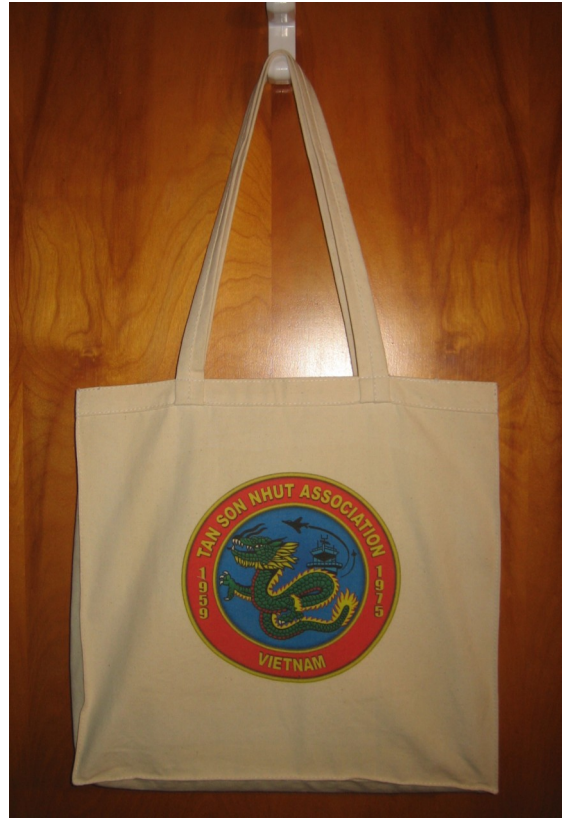
↑ The Bag

We have acquired some nice cloth tote bags (T-42) with the TSNA Logo printed on them. They are 14 by 14 by 3 inches and are made of 100% natural 8 oz cotton canvas. They are great to carry your notepad, gloves, pencils/pins, camera, etc. They will be selling for $10.00 each which includes postage.