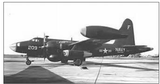
(A P2V picture the Editor found on the Internet)