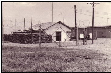
504th Signal Detachment Communications Center

That Christmas season in 1969 was far from the best holiday season that I have had, but it was certainly one of the most memorable. And as this holiday season approaches, it will again be with gratitude for the good things that have come my way in life, and with memories from a long time ago, on an air base on the other side of the world..