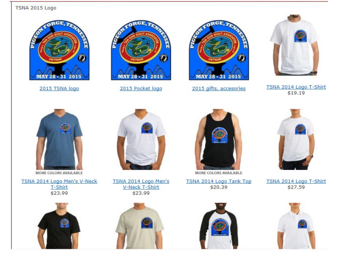
Soooo, it's time to sign up for the reunion and order some of these fine items.

(Editor: Below is just a sample I took from the web site)