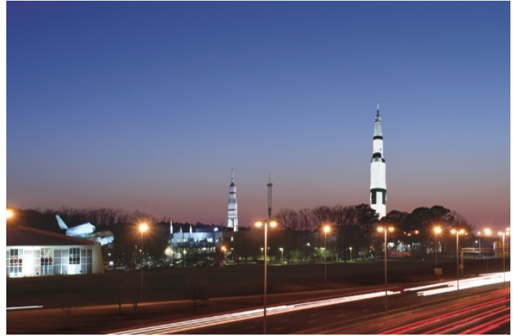
A nighttime picture of some of the visitor attractions in Huntsville, AL.