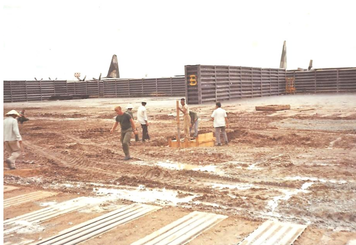
Sep 70 - Sep 71, 823rd & 544th Red Horse Combat Engineers