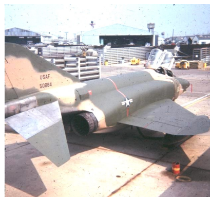
RF-4C Recon. Photo Plane. Photo courtesy of George Greenwood, Sep 66 - Sep 67, 460th FMS Airframe Repairman