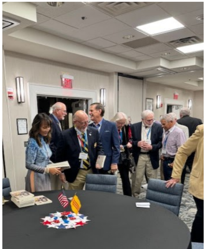
The line of people wishing to thank our speaker and receive an autographed book.