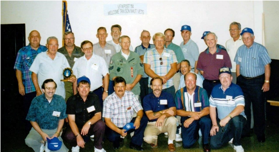
First Tan Son Nhut Reunion