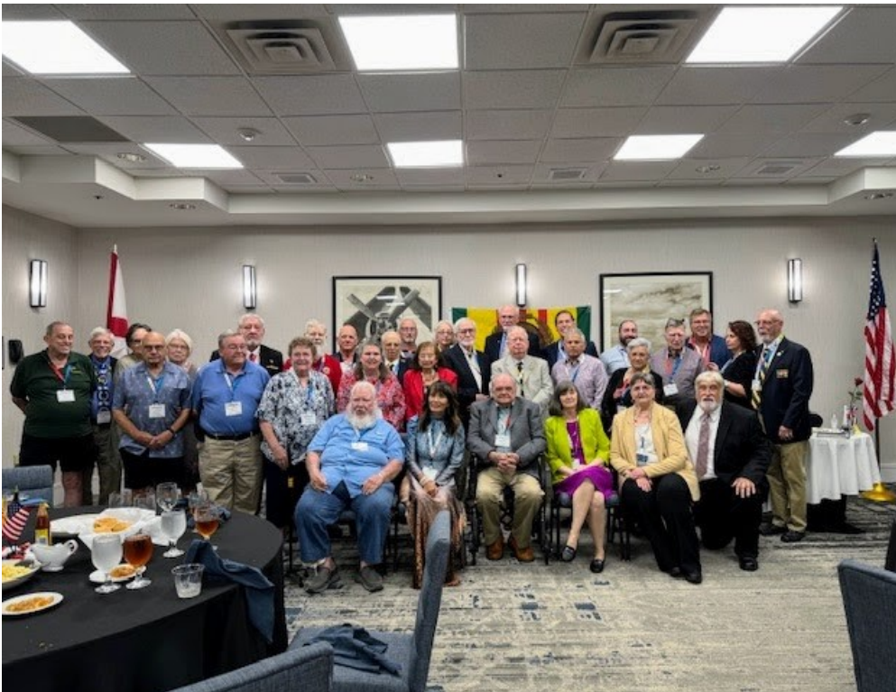
2024 Reunion Group

The Board of Directors wish to thank all who were able to attend for the wonderful company, stories, and support of the Association.