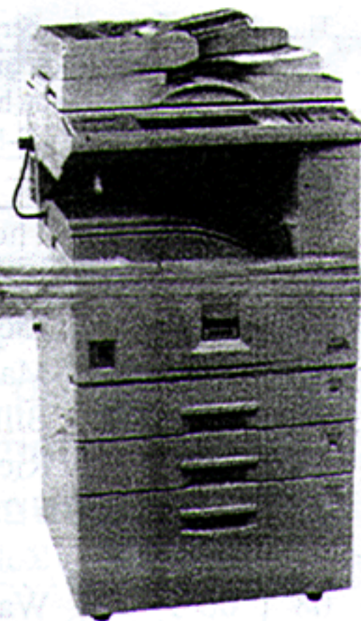
The 2522 with ARDF Shift/Sort and 2,000-Sheet LCT.

Your next issue of Revetments will be a state-of-the-art publication. It will be printed on a printer that was bought by the TSNA members to serve as an instrument for the preservation of the history and memories of those of us who survived ... and those who served and gave their "last full measure of devotion" at Tan Son Nhut Air Base.