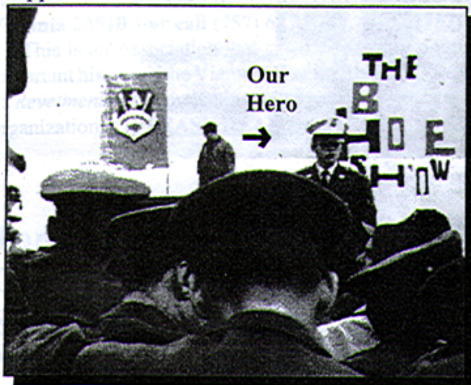
"Another outburst like that and you guys are outta here!"

It is inconceivable that they be asked to serve without some touchstone of our sympathy and support. The USO is that touchstone."