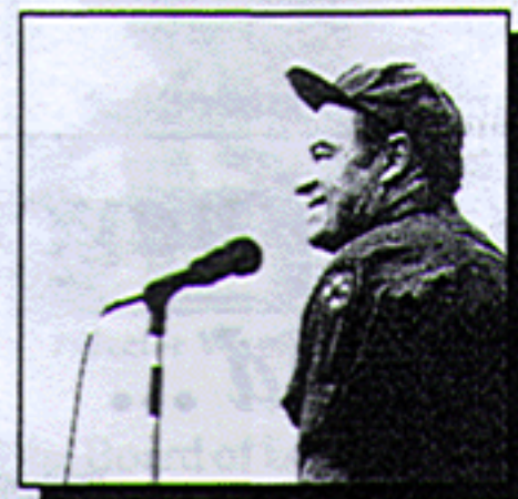
"What do you mean, where's Raquel Welch?"

Of course, Bob says it best, thanks for the memories! You'll be in ours for a lifetime. Thank you, Bob Hope, for a lifetime of magnificent service to your Nation. You have given us the gift of joyous pride!