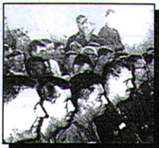
My god, that's you sitting there!

In his special foreword to the 1991 Brassey's book, 50 Years of The USO , Bob Hope wrote, "Currently in the Middle East, our men and women in uniform stand in the twilight between civilization and the raw savagery of war.