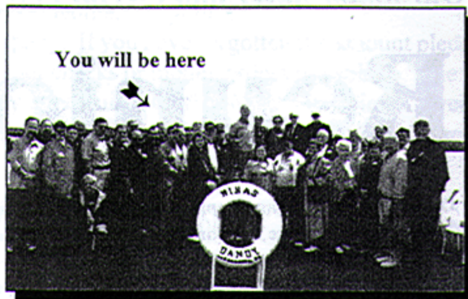
The Nina's Dandy Reunion 2002 luncheon cruise was a definite highlight with TSNA members ... "do it again!" ... they said as they left the boat. We are and you'll be there!

First of all, Reunion 2003 will be a lot less expensive than previous reunions. The further away you live, the more expensive it is to get there and back. We can't do anything about that, but we are doing something about the fact that you're not going to be hit with a whopping menu of fees when you arrive. Last year (Reunion 2002), the registration fee was $160. This year we are hoping to keep the fee under $100 (per person), and this will include the river cruise luncheon, the formal awards