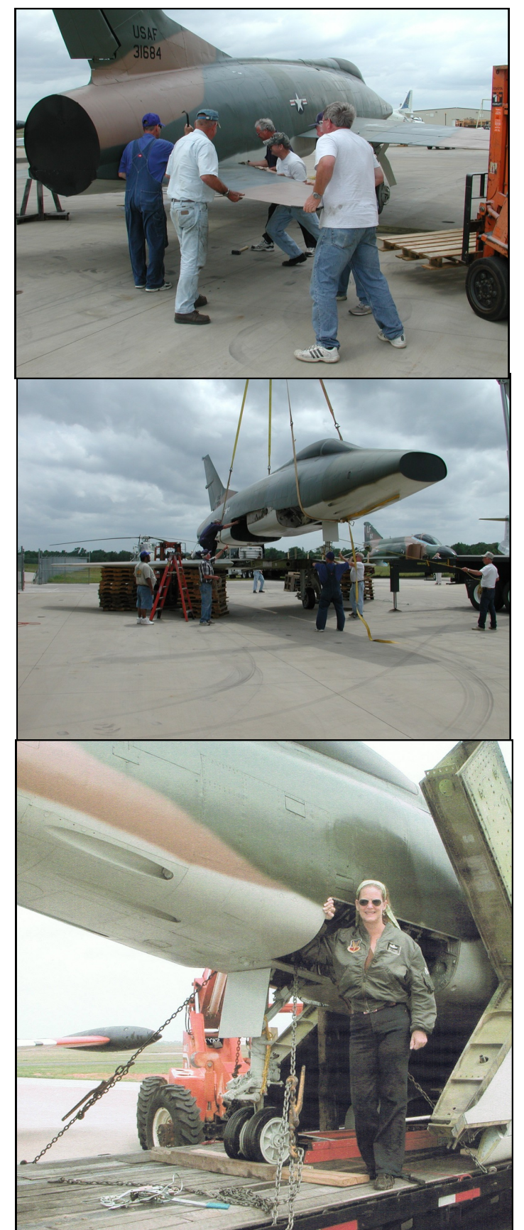
Pictures taken at Historic Aviation Memorial Museum

According to the map directions I looked up on the internet, these two museums are only 36 miles apart. So if you are in the area, check things out.