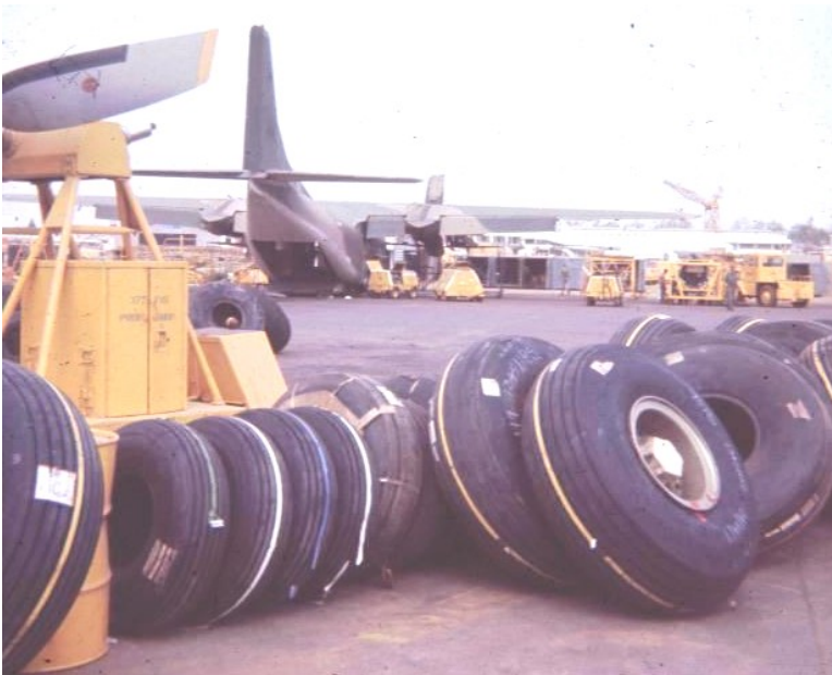
titled "Tire Shop and C-123 Plane."

TSNA and its officers, directors, employees and agents do not make any guarantees of any kind about the content, accuracy, or timeliness of information in the TSNA newsletter, Revetments . The use of information from this newsletter is strictly voluntary and at the user's sole risk. TSNA shall not be liable for any damages of any kind related to the information in this newsletter. The opinions expressed in the newsletter are those of the authors and do not constitute the opinion or policy of TSNA.