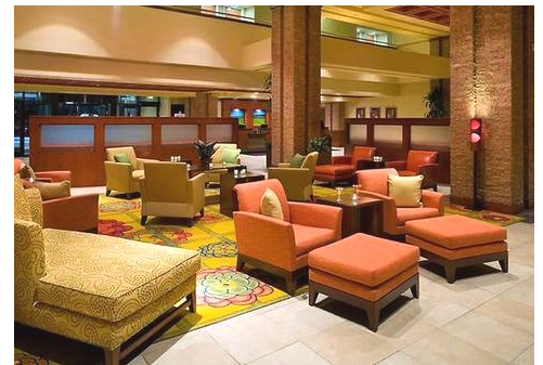
Lobby, Marriott Colorado Springs