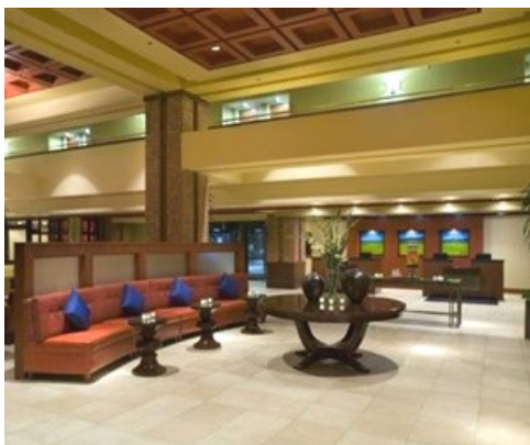
Lobby, Marriott Colorado Springs