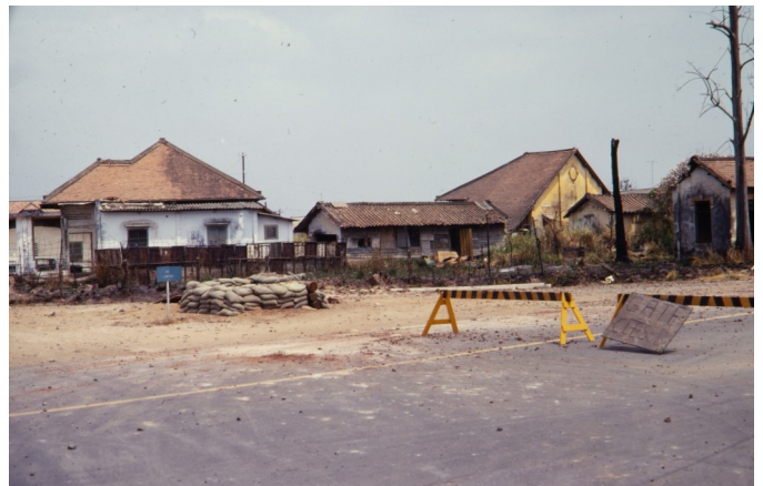
Damage by the Main Gate

EDITOR'S NOTE: Yea, another note! The next page contains excerpts from the official diary/report of the Chaplain section at Tan Son Nhut Air Base, February, 1962.